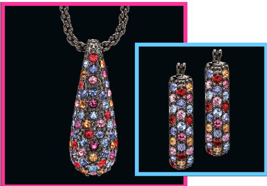
Business Woman of the Year