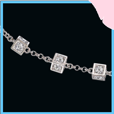
Rookie of the Year & Most Improved