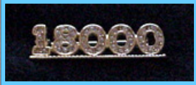
Crystal Bar Pin